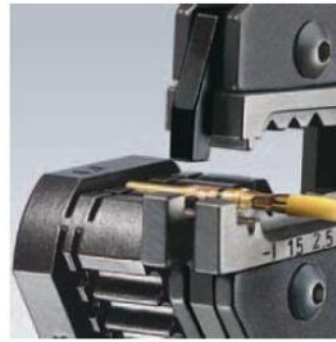
97 43 200 with crimping dies 97 49 61 and revolvable locator 97 49 90 for tuned types of connectors with varying pin diameters