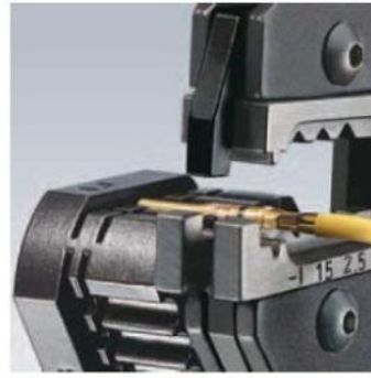
97 43 200 with crimping dies 97 49 61 and revolvable locator 97 49 90 for tuned types of connectors with varying pin diameters