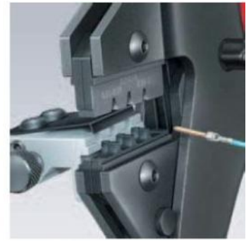
97 43 400 Crimp System Pliers with crimping dies 97 49 24 and locator 97 49 93 for D-Sub plugs