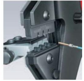
97 43 400 Crimp System Pliers with crimping dies 97 49 24 and locator 97 49 93 for D-Sub plugs