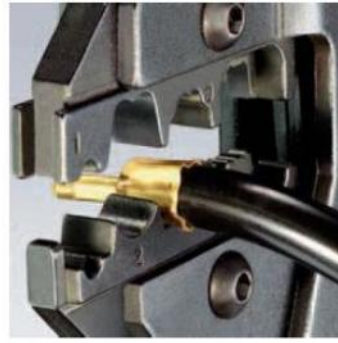
Crimp System Pliers 97 43 200 with crimping dies 97 49 35 for spark plug connectors