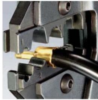
Crimp System Pliers 97 43 200 with crimping dies 97 49 35 for spark plug connectors